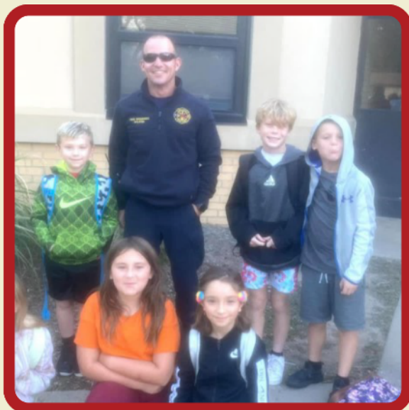
Salina Fire Department