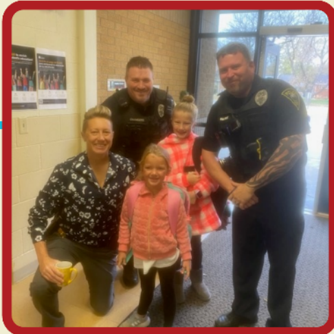
Salina Police Department