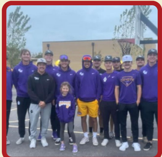
Kansas Wesleyan Football Team