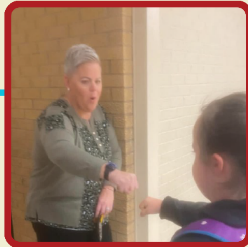
Bennington State Bank